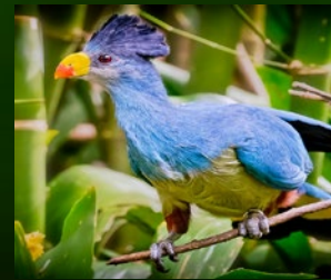
Great Blue turaco