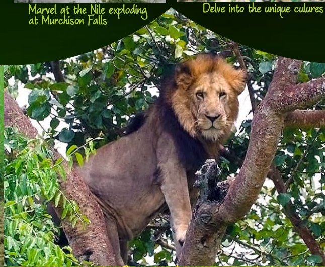
Gaze at the rare tree-climbing Lions