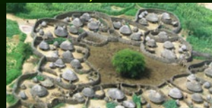
Delve into the unique cultures