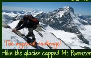
The mystical challenge! Hike the glacier capped Mt Rwenzori