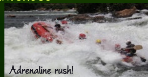
Adrenaline rush! Raft the Nile