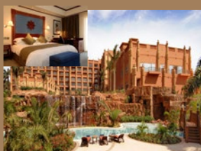
Exquisite Hotels & Lodges