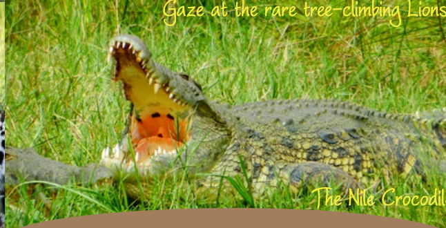
The Nile Crocodile