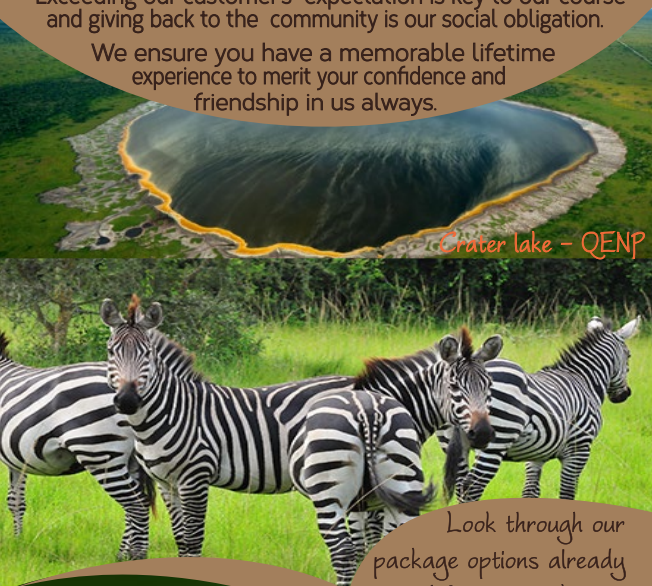
Crater lake - QENP

We ensure you have a memorable lifetime experience to merit your confidence and friendship in us always.