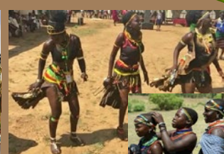
Experience culture in diversity